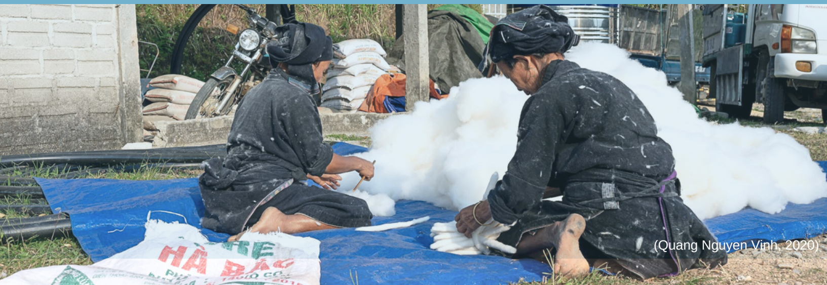
(Quang Nguyen Vinh, 2020)

The YESS due diligence approach is expanded to address other labor and human rights, and environmental risks in the production of cotton and other raw materials.